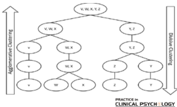
Figure 1. Agglomerative and divisive clustering.

with each observation as a separate cluster; and in a stepwise procedure, the most similar clusters merge together, ending with one cluster with all the observations. Divisive starts with one cluster with all observations; and recursively split the clusters into most dissimilar ones (Figure 1). The process finishes when each observation is placed in a different cluster (Everitt et al., 2011; Kaufman & Rousseeuw, 2005). Single linkage (nearest neighbor) (Florek, Łukasiewicz, Perkal, JSteinhaus, & Zubrzycki, 1951), the algorithm that is used for finding outlier data in this study, belongs to agglomerative clustering which is explored in the choosing clustering algorithm section.